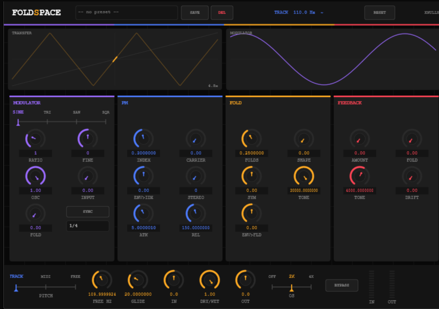
The full Foldspace interface at default settings.

The Foldspace window is organized top-to-bottom into a top bar, two live displays, four stage strips, and a bottom global bar. The strips follow the signal flow left to right – MODULATOR (violet), PM (blue), FOLD (spice), FEEDBACK (red) – matching the accent strip under the top bar.